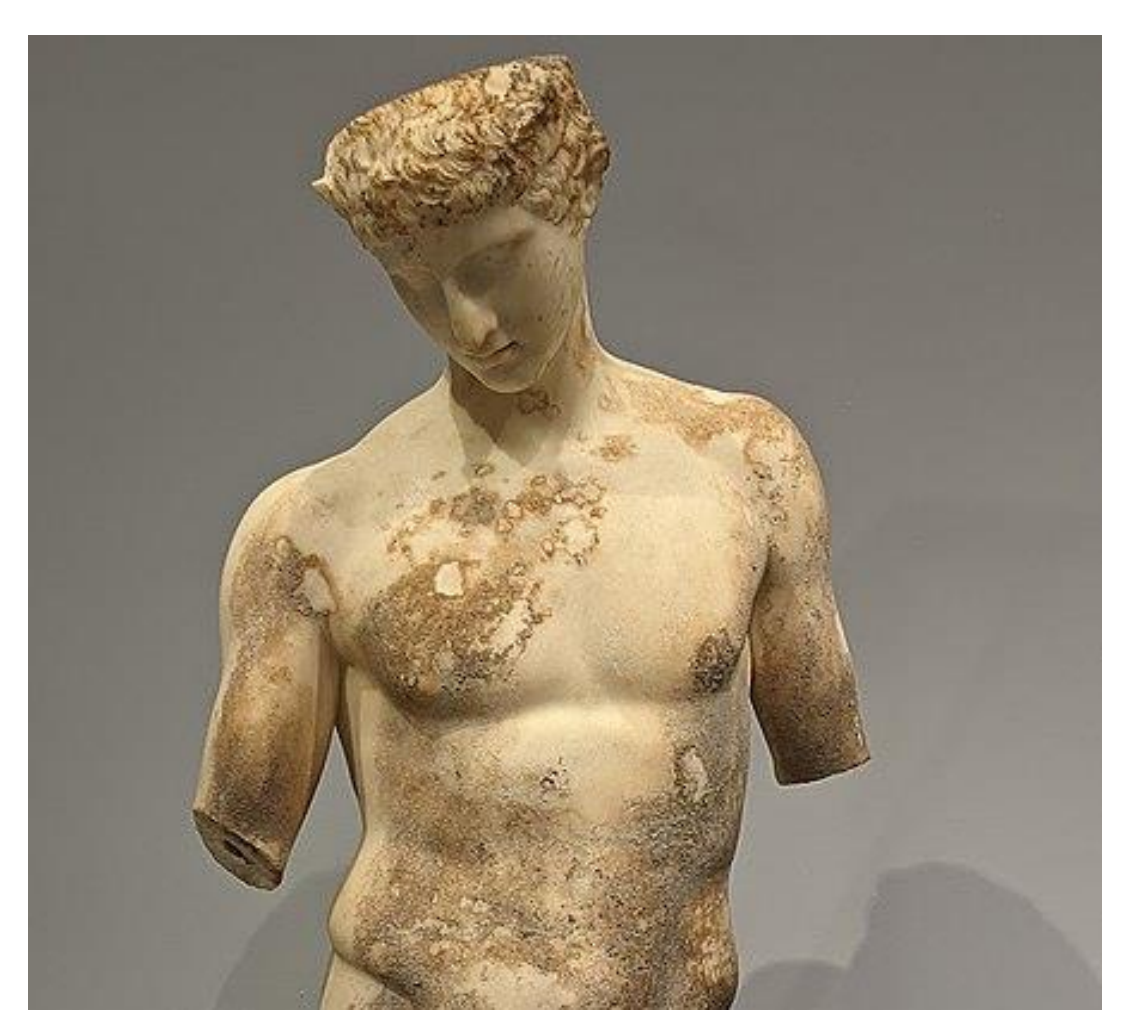
Mercury (ca. 30 – 50 CE). This sculpture is in the museum of Fine Arts, Boston, MA.

Like most representations of the god, this statue originally had wings on either side of the head. His arms may have held a caduceus and a sack of gold. Wings symbolize his penchant for flight and height, a caduceus for his role as herald and messenger, and gold for trade and commerce. Multifaceted, Multifarious and Magical Mercury –