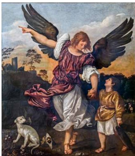
Archangel Raphael (Archangel of Mercury) and Tobit by Titian

The third level is called tropological because at this point we are invited to 'turn' in our perception; we cross a mental threshold and the symbols begin to speak in a different way. As Angela Voss puts it, 'the 'turning inward' can be seen as the third