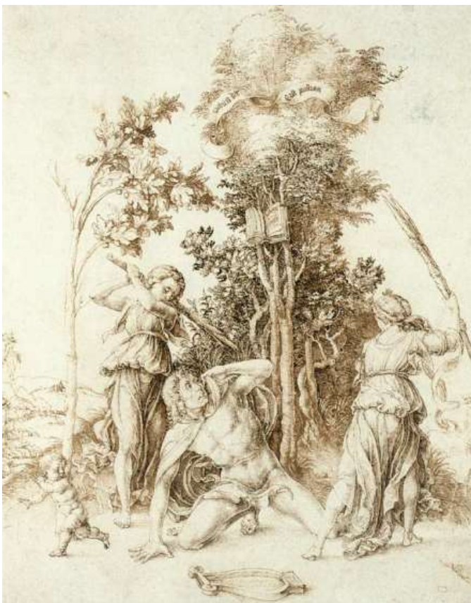
Orpheus descent into limbo

Beyond the conscious reasoning mind is the faculty of imagination and intuition, a faculty which responds instinctively to the symbol as 'an energy-evoking, and directing, agent'. 16 Jung suggests that a symbol arises spontaneously from the unconscious, a potent image of an archetypal pattern not immediately accessible to the conscious mind. To understand it more fully we must move beyond intellect into a frame of mind which not only accepts mystery and ambiguity (so we grasp that the symbol describes what we see but also hints at what